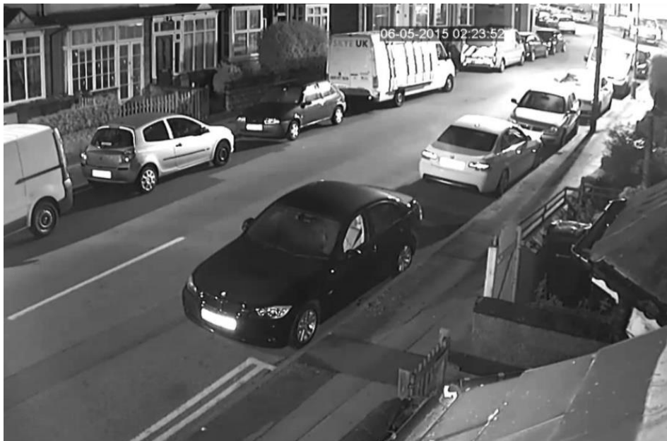
Note: This is a low-resolution screengrab of a night time image

Different cameras have different levels of IR illumination, most illuminate up to 20-40 metres from the Camera, therefore this is another important consideration in camera selection.